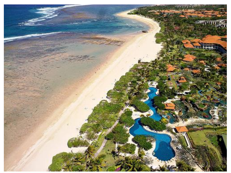
Nusa Dua Beach

Nusa Dua beach is very clean and quiet, the sea is very calm so easy to swim in. All in all its not a busy beach like Kuta and is only used by the tourists in the hotels. There are not many beach vendors which makes it a stress free experience.