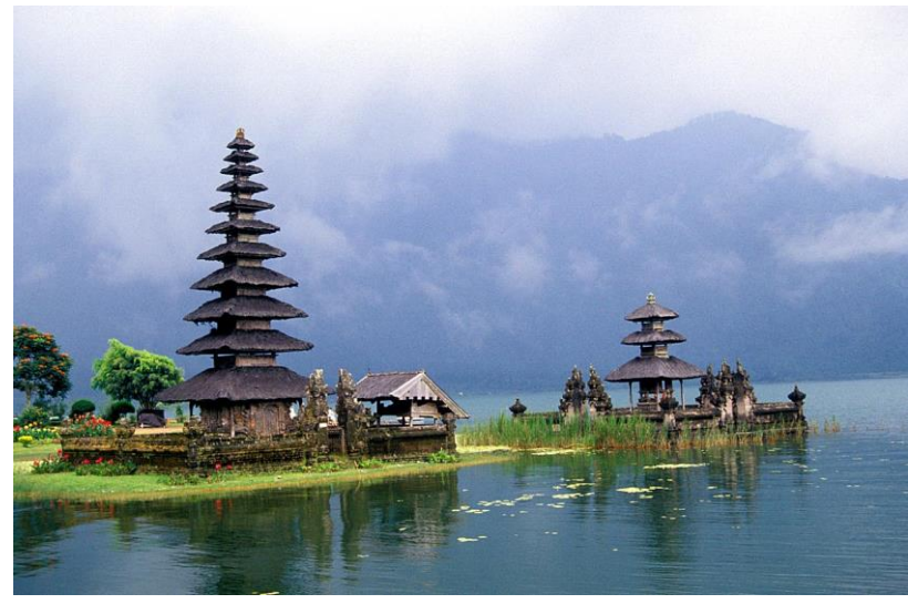
Bedugul Lake and Temple

Beratan Lake is situated in the plateau area with cool atmosphere surround it. It is an ideal place for relaxation while enjoy the beautiful panorama of lake. The accommodations are also available in this area where is the perfect place for overnight stay, resting and enjoy the beautiful panoramic of lake with the Ulun Danu Temple as a magnificence. The small scale of agriculture activities are likely conducted around this lake and can be perceived at the same time circle around it. If we encircle it, we can take photograph with the beautiful background view or make the picture sketch face in painting mini studio at the lakeside with a short time as a souvenir.