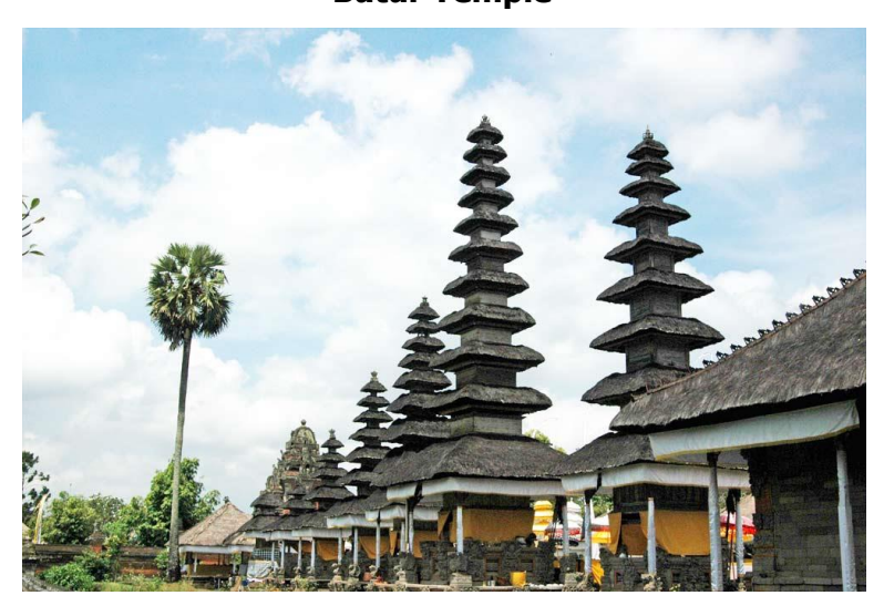
Taman Ayu Temple