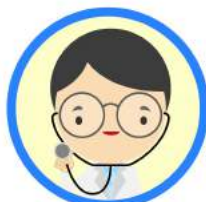
See a doctor