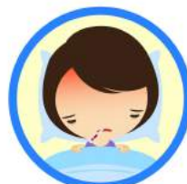
Stay at home