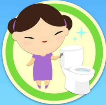
Flush fully after use