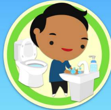
Wash hands with soap after using the toilet