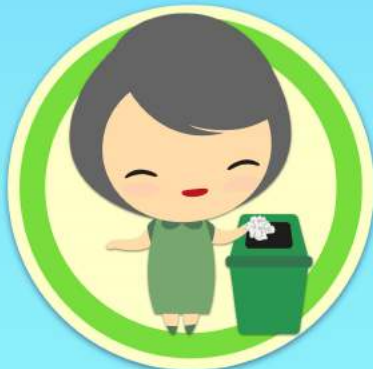
Throw used tissues in trash bins