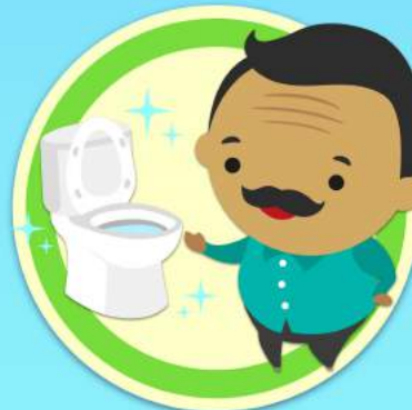
Keep toilets clean and dry